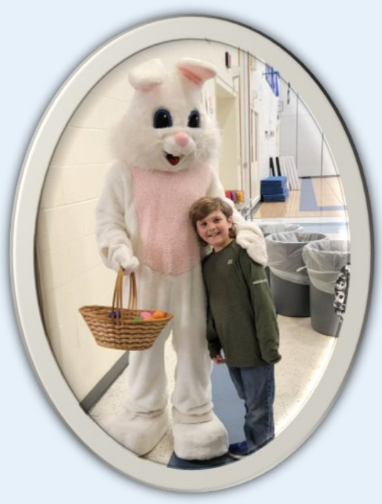
Breakfast with the Easter Bunny at Deposit Elementary

This newsletter provides a few highlights from this past year and gives you an overview of the proposed 2022-2023 budget. You can hear more about the budget at the public presentation on May 9th at 5 PM in the elementary library. I look forward to seeing you at our year-end celebrations.