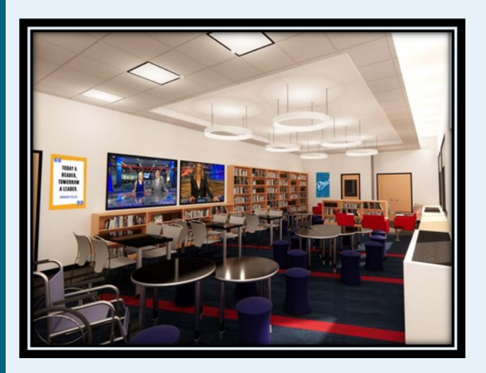
Above: Rendering of the proposed renovation for the high school library/media center.